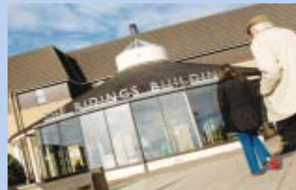
Pinderfields General Hospital